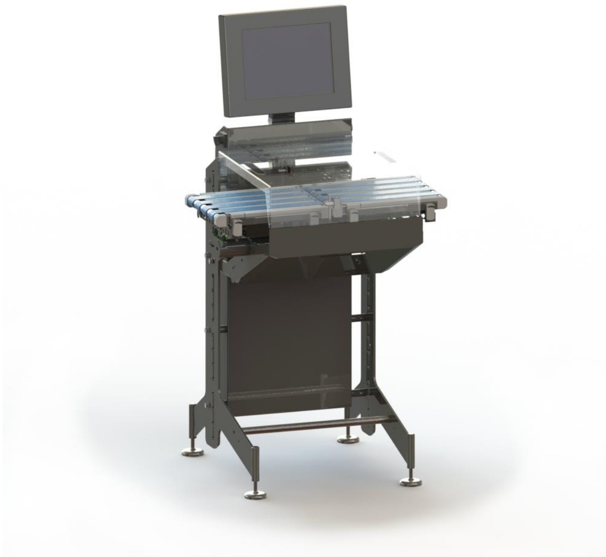
Figure 1 SC500 – example of mechanical construction