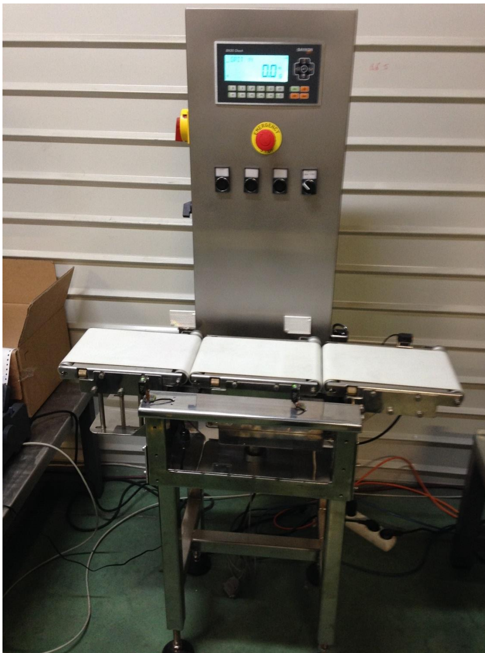
Figure 3 Example of a BX30 Check - automatic check-/catchweighing instrument.