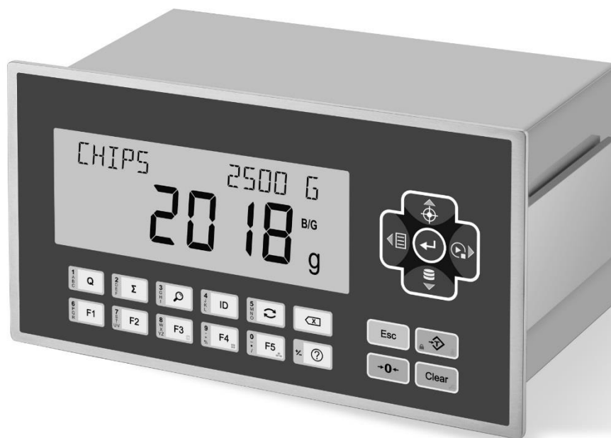
Figure 1 BX30 Check indicator.