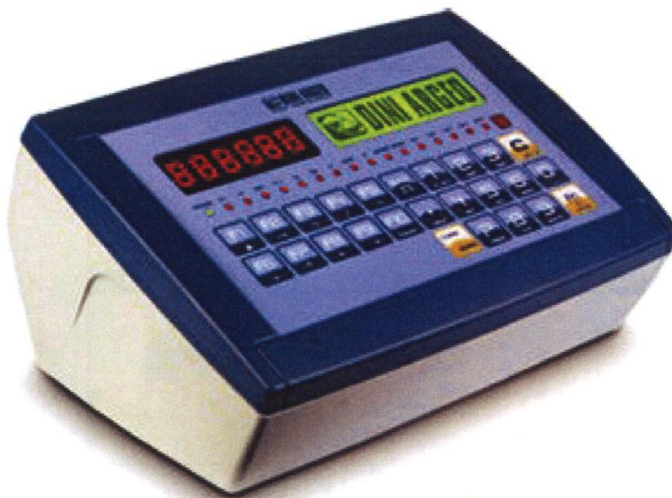
Figure 2 3590E indicator model