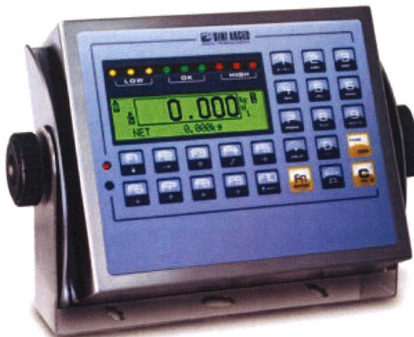
Figure 3 CPWE indicator model