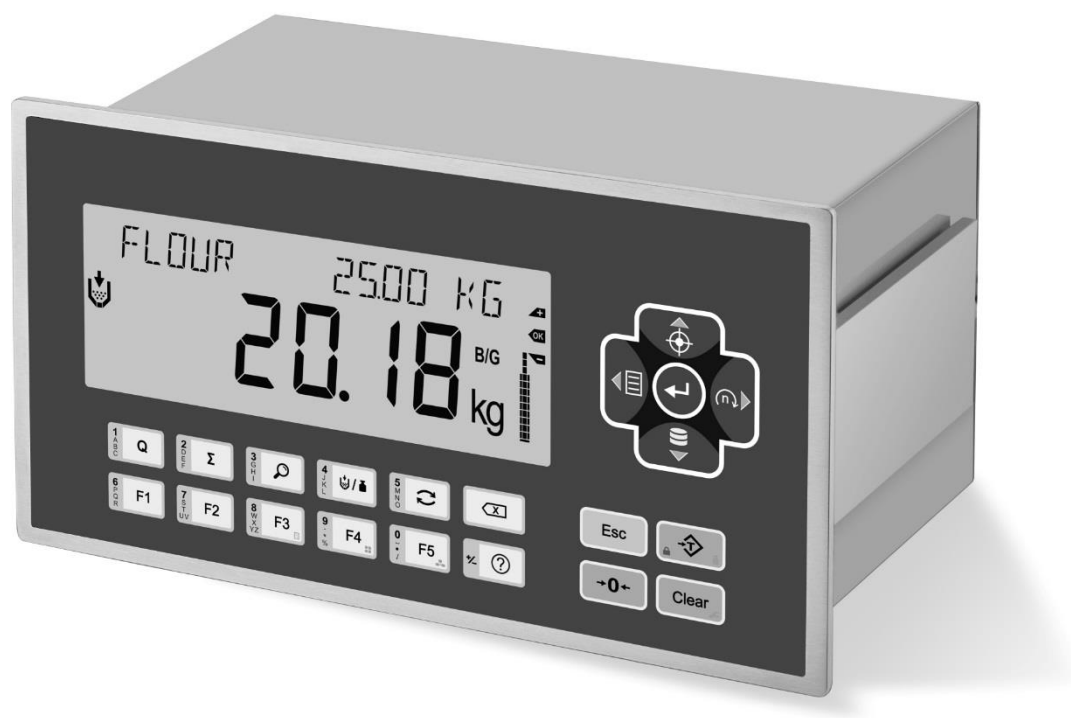
Figure 1 BX30 Fill indicator.