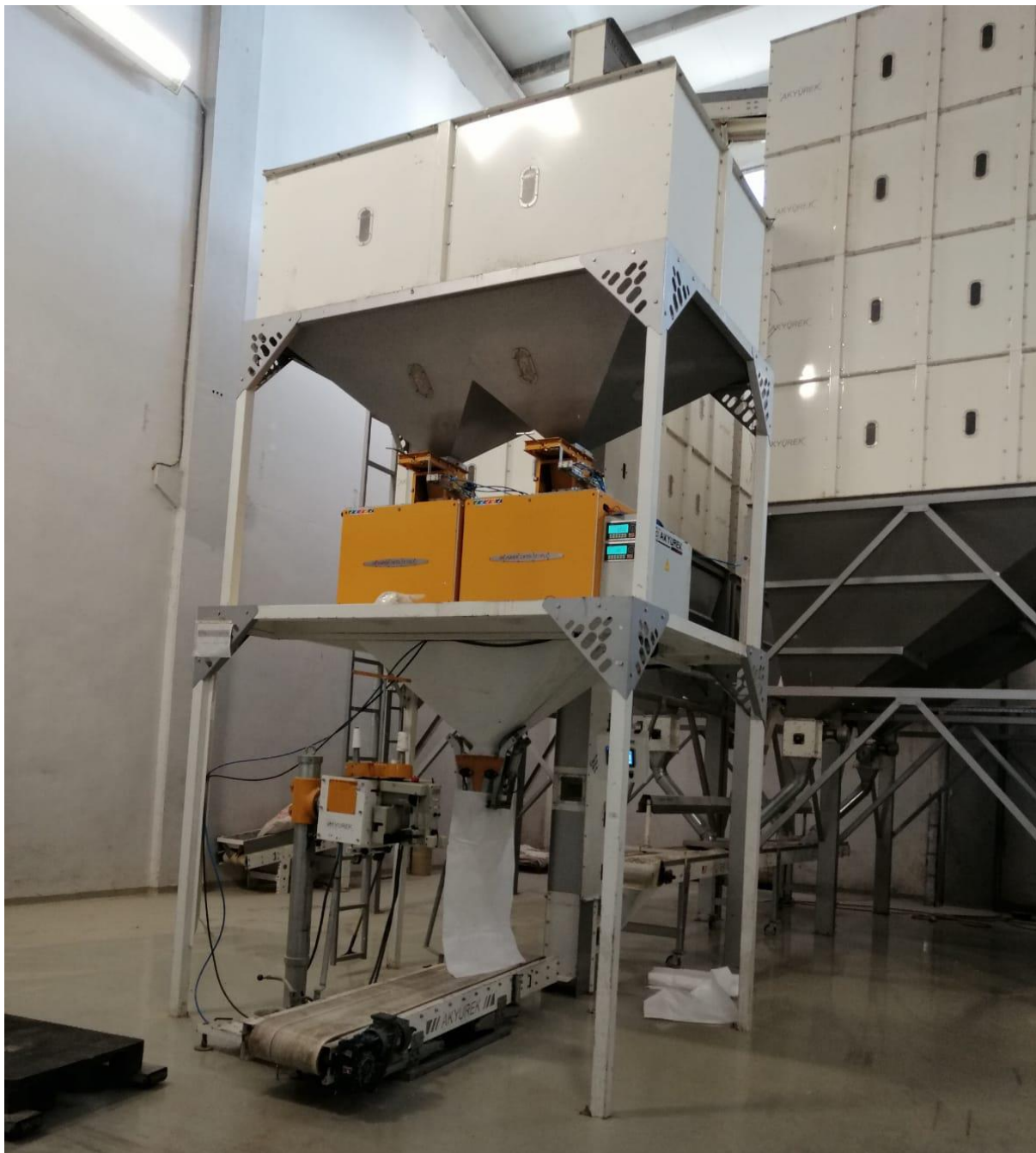
Figure 3 Example of a BX30 Fill automatic gravimetric filling instrument.