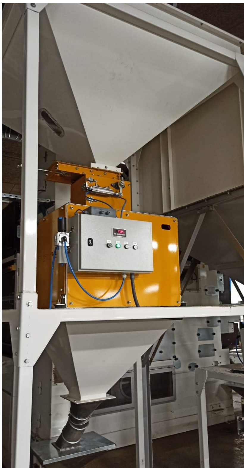
Figure 4 BX13 AGFI with platform load receptor for mode net filling