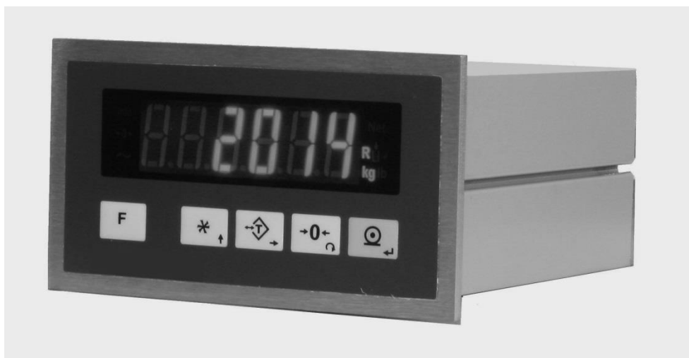
Figure 1 BX13 indicator.