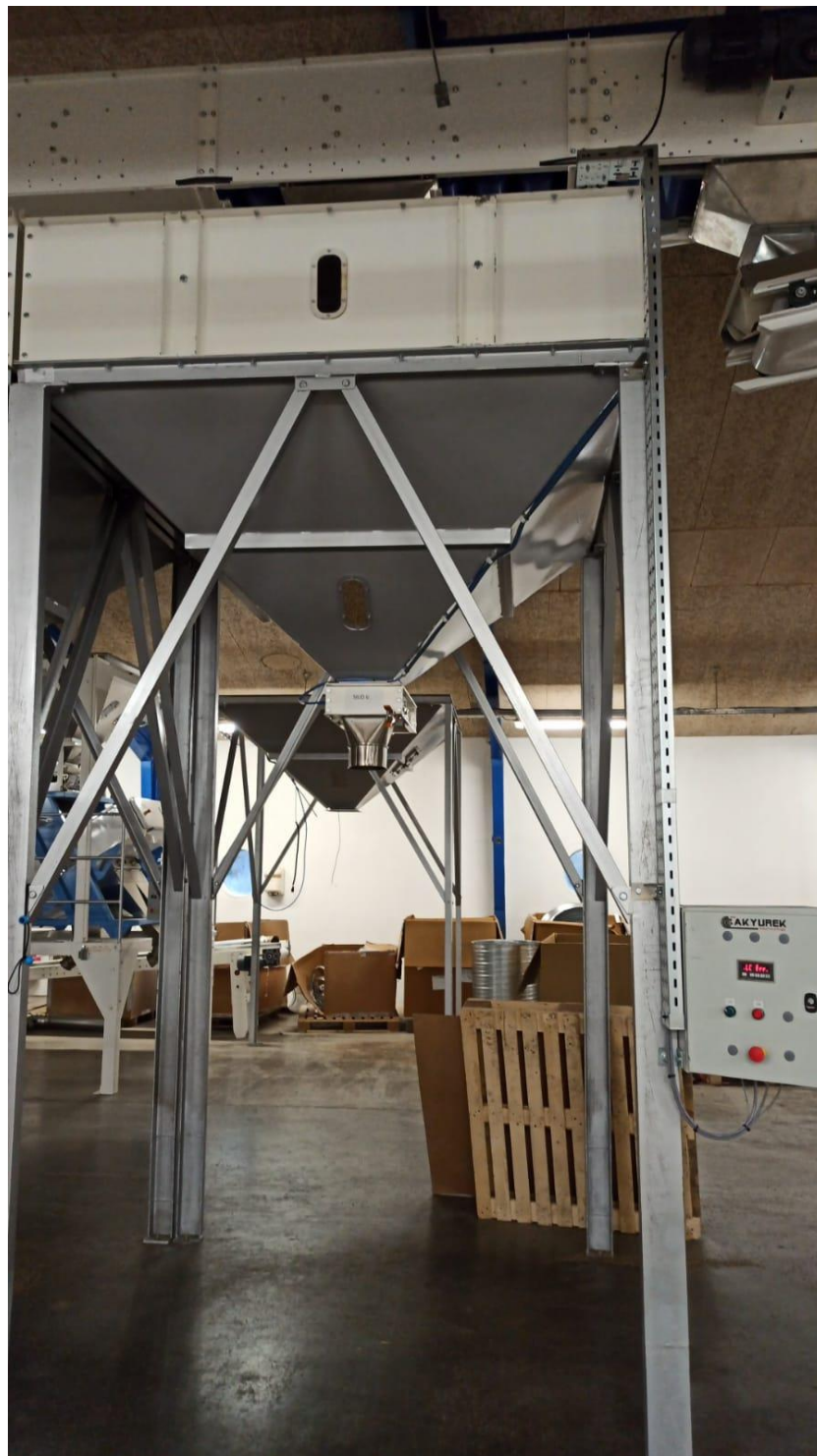
Figure 4 BX14 totalizing hopper weigher with vibration feeding