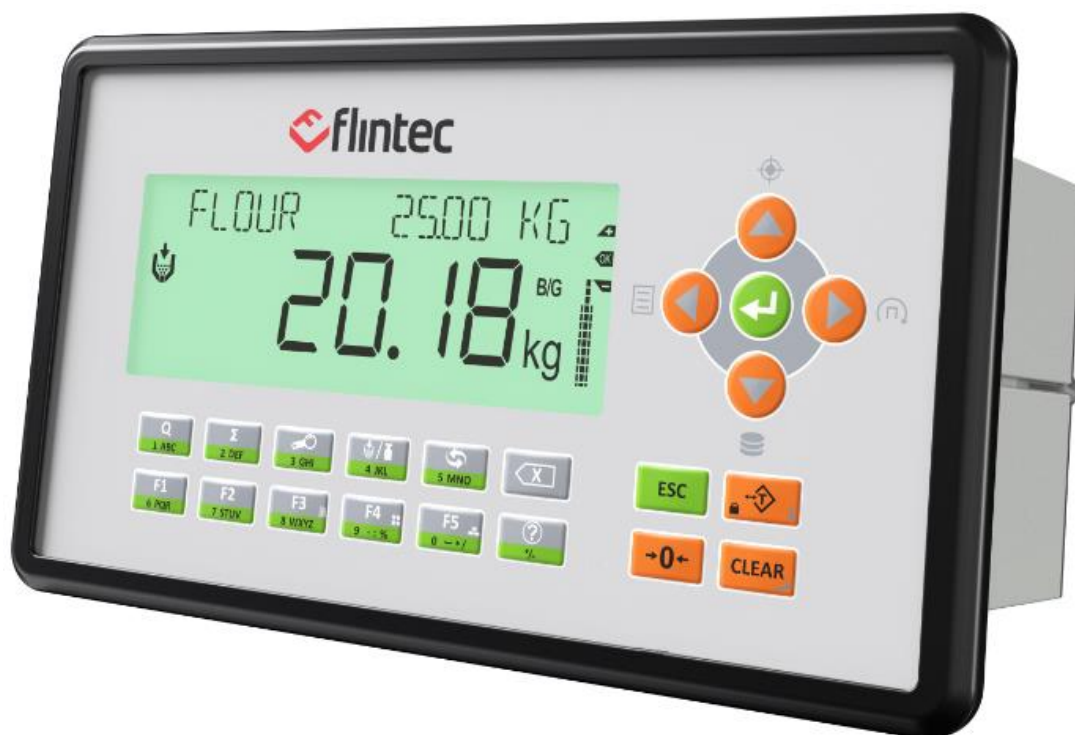
Figure 1 FT-113 Fill indicator.