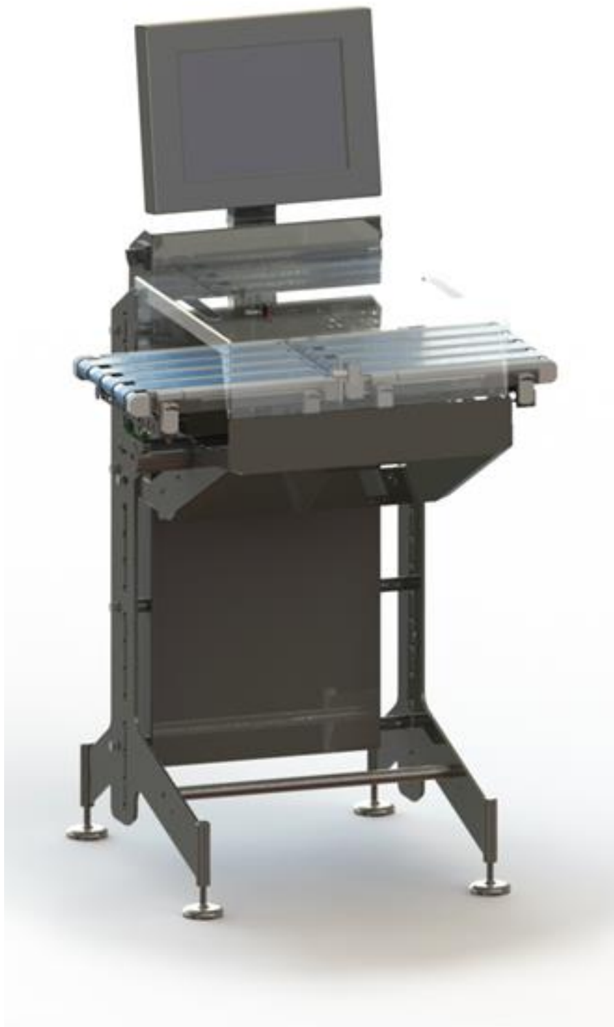
Figure 1 ES-W 5xyz - Example of mechanical construction