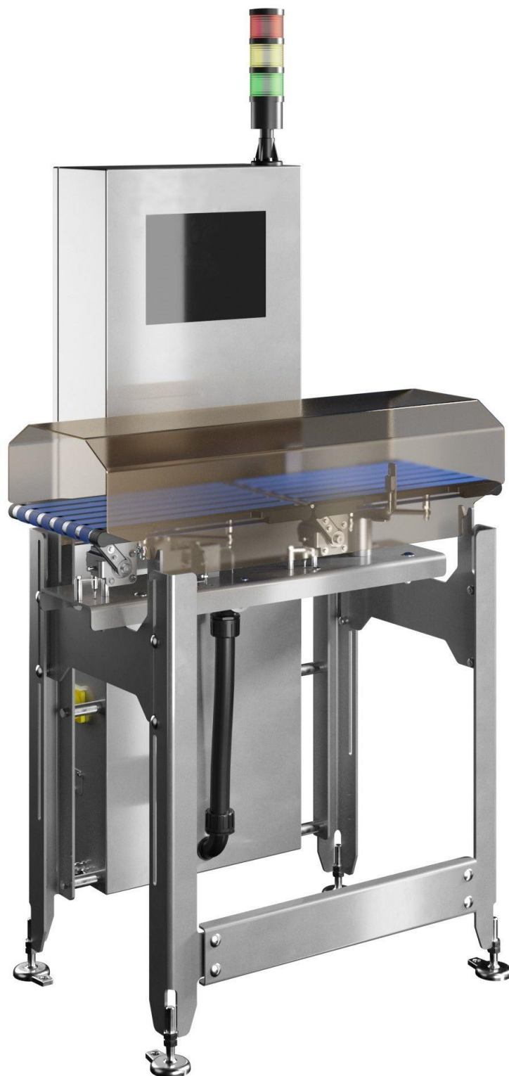
Figure 2 ES-W 5xyz – example of mechanical construction