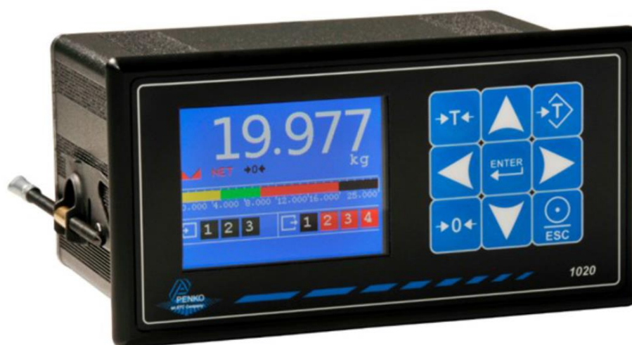
Figure 1 1020 in panel mount enclosure