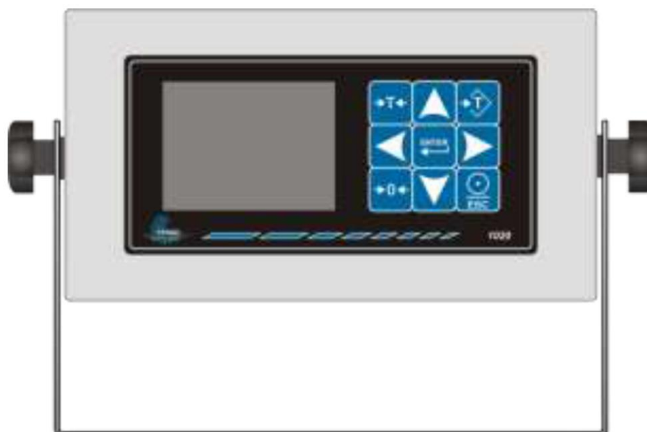
Figure 2 1020 in stainless steel enclosure