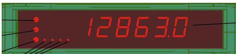
Figure 2 SGM8x0 front with cover closed