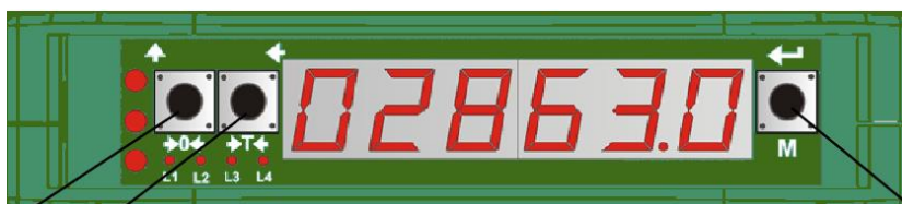
Figure 3 SGM8x0 front with cover opened