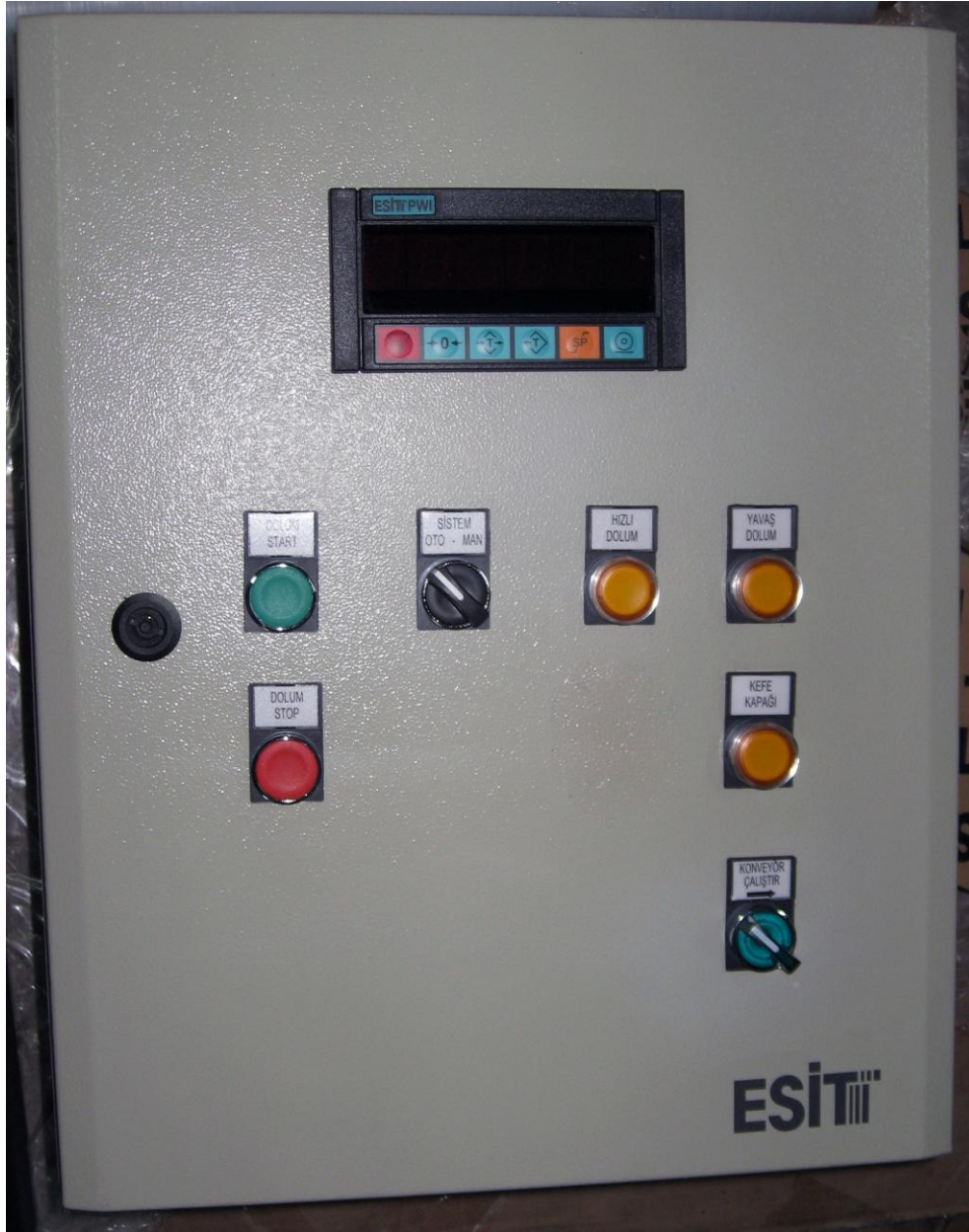
Figure 1. HS control with panel mounted PWI indicator.