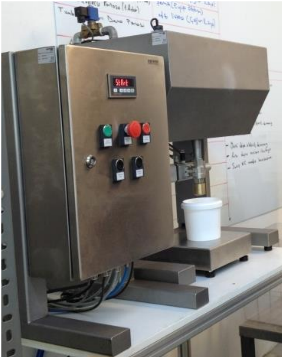
Figure 4 BX13 AGFI with platform load receptor for mode net filling