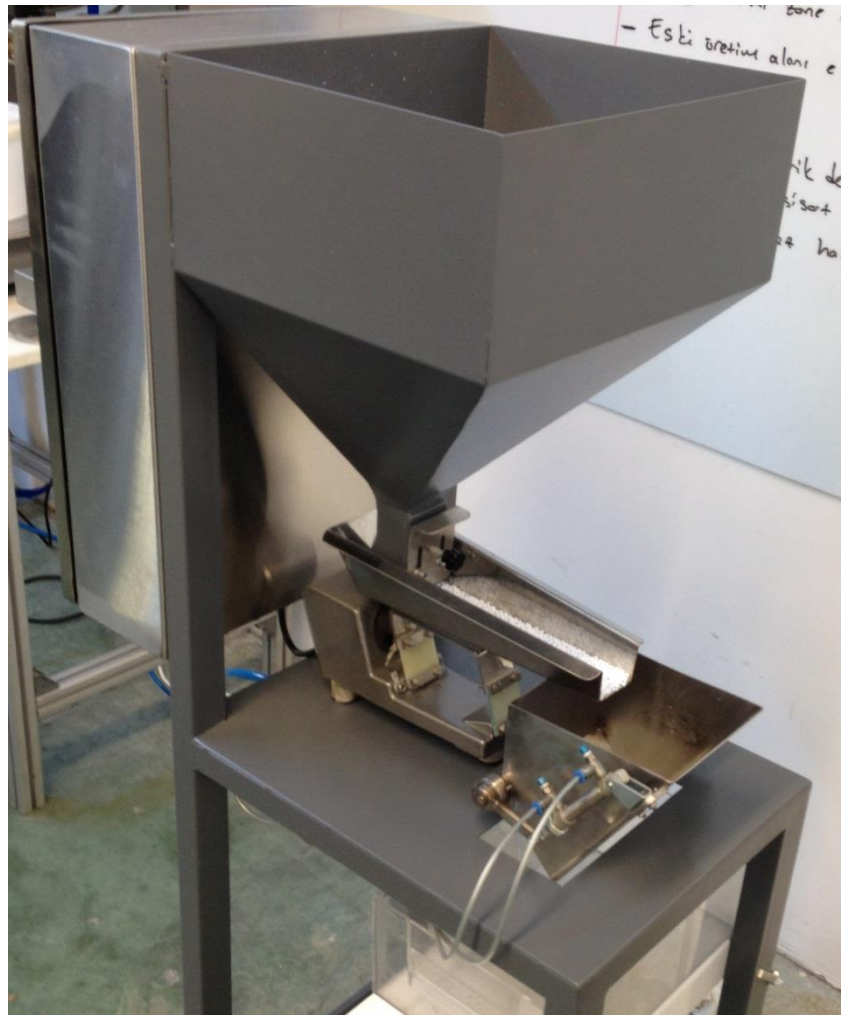
Figure 4 FT-10 Flow totalizing hopper weigher with vibration feeding