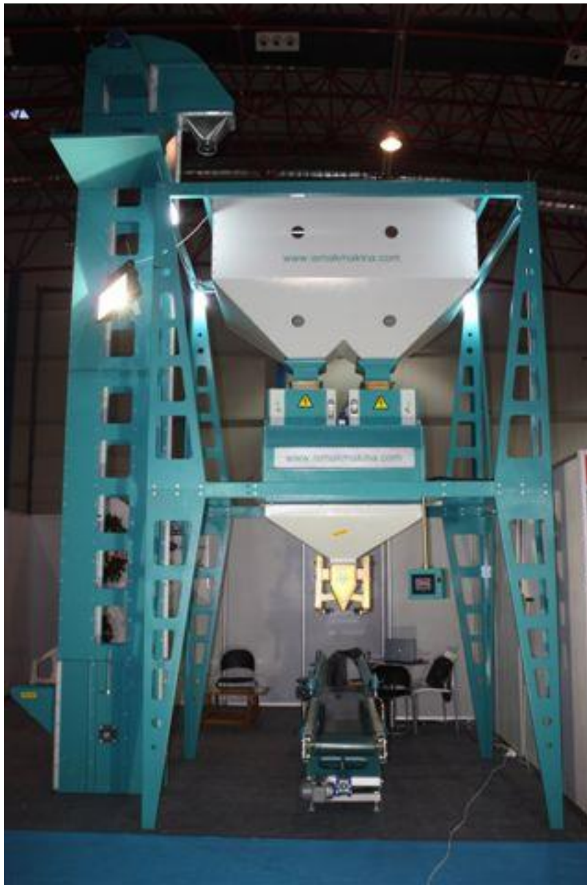
Figure 4 BX13 AGFI for bag filling