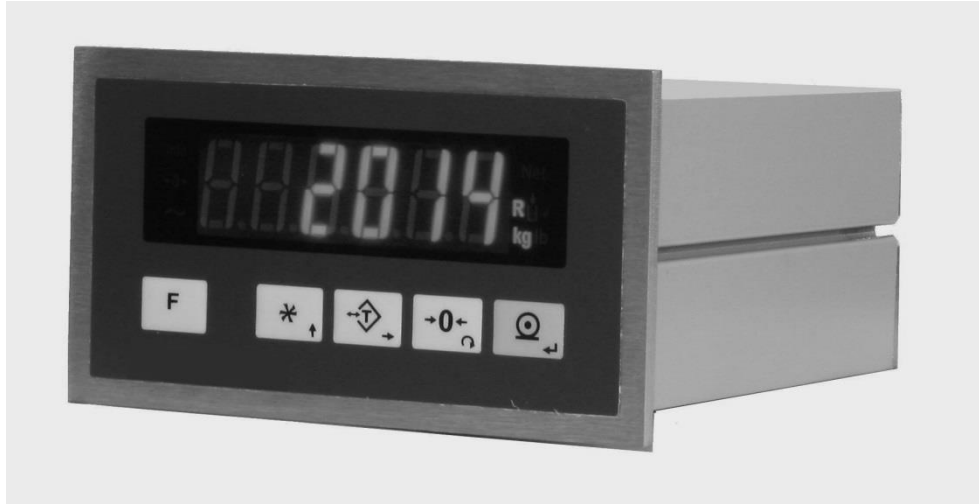
Figure 1 BX13 indicator.