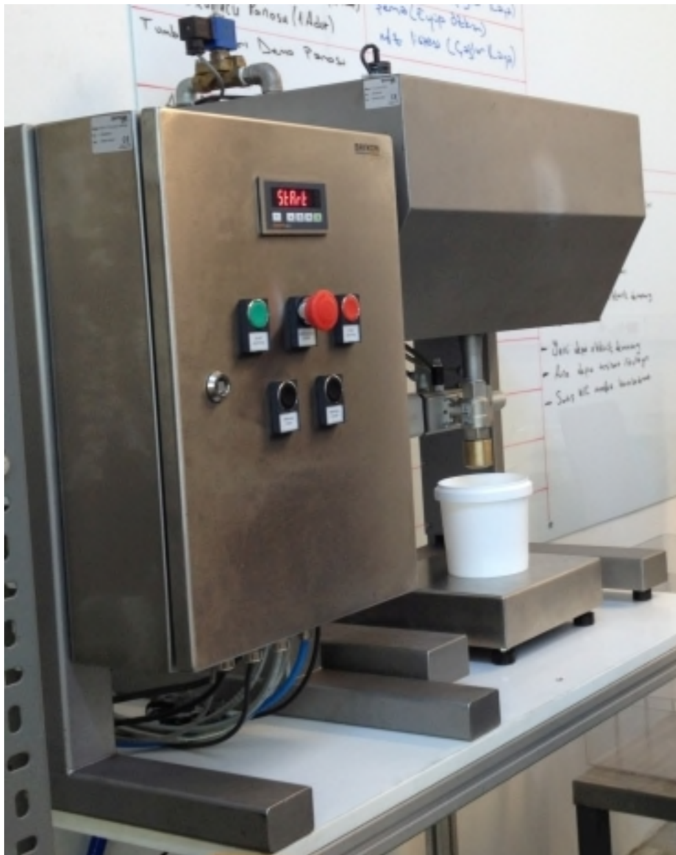
Figure 4 BX13 AGFI with platform load receptor for mode net filling