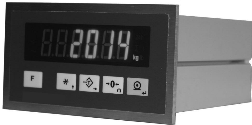
Figure 1 BX14 indicator.